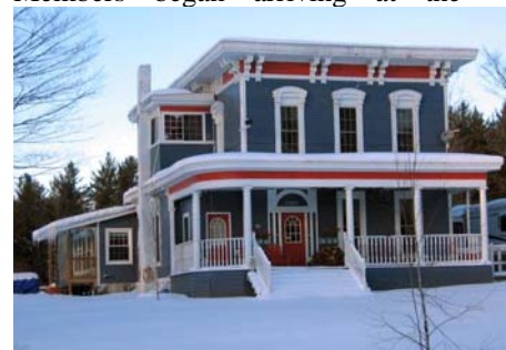
Allegro House in Port Leyden early