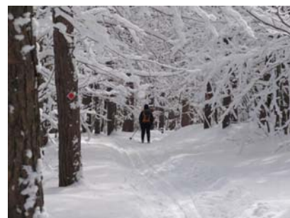
The snow at Highland Forest, Feb 24