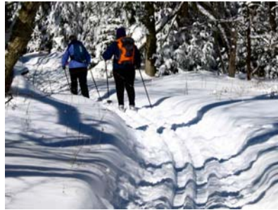
Southside Loop Trail

delightful six-mile ski on the Southside Loop Trail, constantly marveling at the beauty surrounding us.